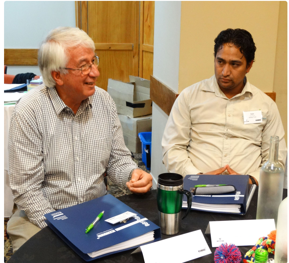
Participants on our early governance training. Look how thick that workbook is. My goodness, you wouldn't want aunty to hit you with that thing!